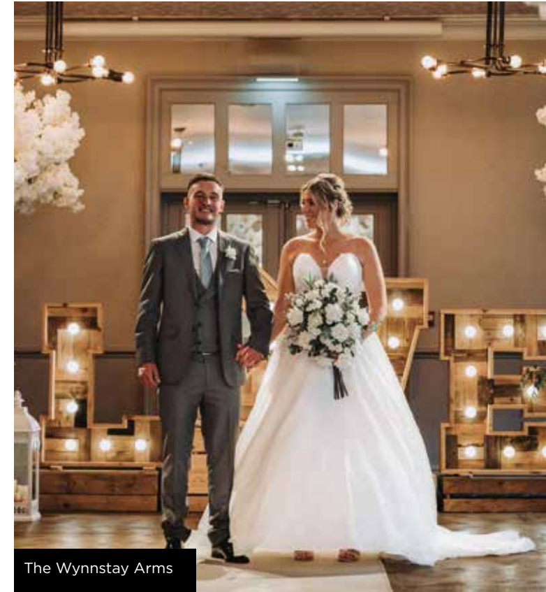
The Wynnstay Arms

The Wynnstay Arms, with its historic charm and modern facilities, offers a seamless blend of old and new. This venue is perfect for those who appreciate the elegance of traditional architecture, complemented by contemporary comforts. The Wynnstay Arms prides itself on creating a luxurious experience, ensuring every wedding is both grand and personal.