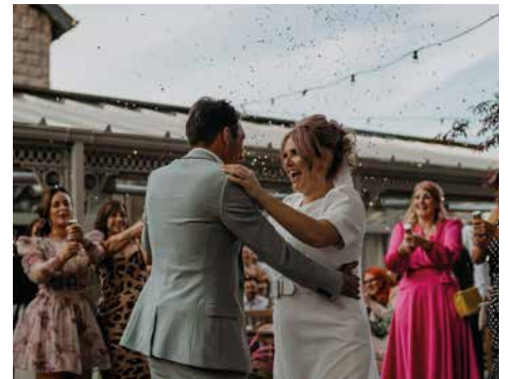
The Spread Eagle

So, if you're planning your big day and looking for a venue with character, consider Robinsons' stunning venues – where your dream wedding can become a reality.