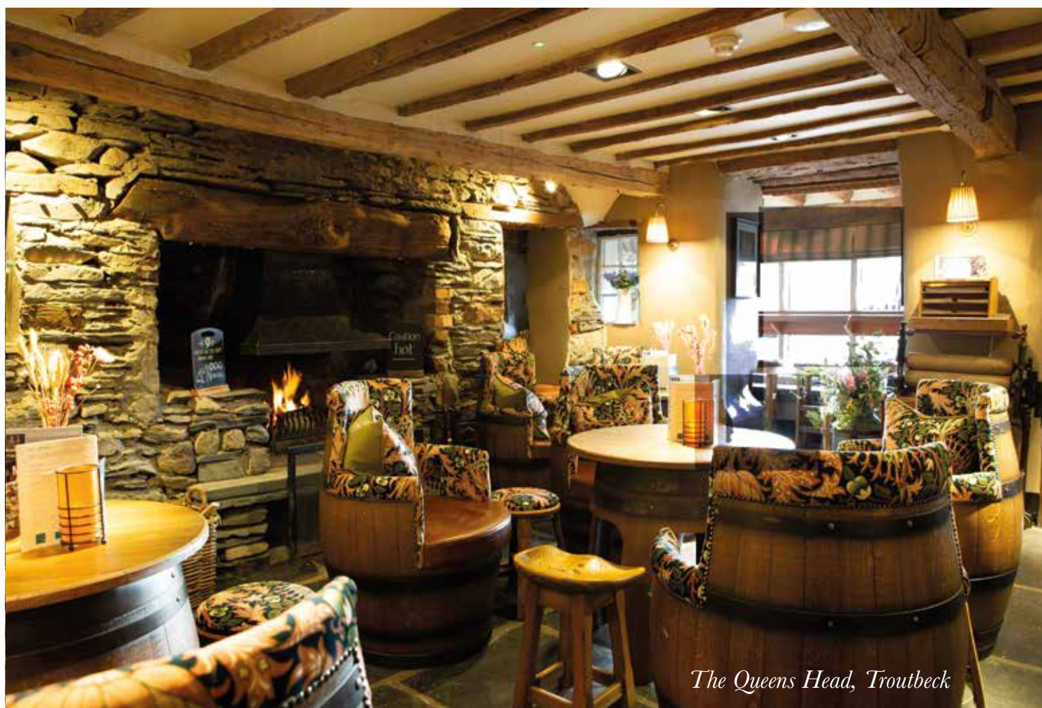
The Queens Head, Troutbeck