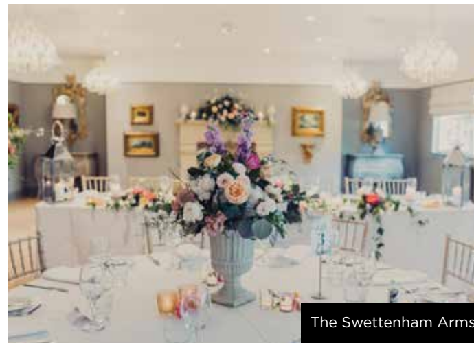
The Swettenham Arms

Nestled in the heart of the Yorkshire countryside, the Tempest Arms is a venue that exudes rustic charm. Known for its warm, welcoming atmosphere, this venue is perfect for couples looking for a cosy yet elegant setting. With its beautiful stone architecture and rolling hills as a backdrop, the Tempest Arms provides a picturesque setting for both ceremonies and receptions.