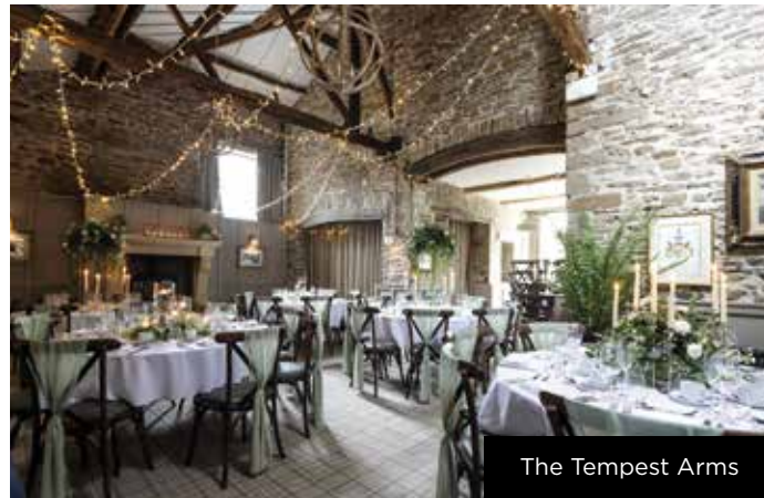
The Tempest Arms

Explore our wonderful collection of venues, showcasing why a wedding at a Robinsons location is not just an event, but the beginning of a beautiful journey in your life together.