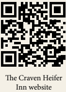
The Craven Heifer Inn website

Following 8 other successful acquisitions and transitions over the last 12 months for our managed pub estate, Robinsons are demonstrating a positive level of business growth and are very pleased to welcome this pub to their estate.